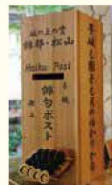
Matsuyama City Tourist Haiku Post