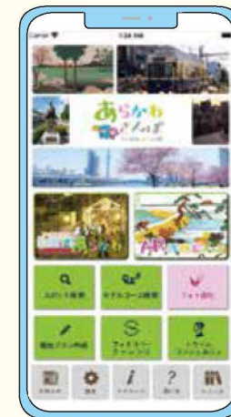
*The image is for illustration purposes.