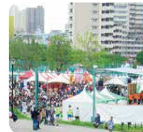
Kawanote Arakawa Festival | Event date | April 29 every year