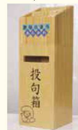
Arakawa Haidan box

Left: Featured in the haiku, “Imozaka mo dango mo tsuki no yukari kana” (“Both Imozaka and dango are related to the moon”), by Masaoka Shiki, and in a novel, “Wagahai Wa Neko Dearu” (“I Am a Cat”) by Natsume Soseki, the Habutae Dango main shop features, a tourist haiku post from Matsuyama City in Ehime Prefecture, connected to both Shiki and Soseki. Haiku submitted here are sent to Matsuyama City once every three months for selection.